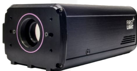
Fig. 2 : C-RED 2 camera

The C-RED 2 cameras when used at -40^{\circ}\text{C} have shown outstanding capabilities thanks to the unique combination of their performances: readout noise <30 electrons, ultra low dark 600\text{e/p/s} , 600FPS frame rate and 93dB dynamic range at the same time. They outperform deeper cooled cameras at a more affordable cost.