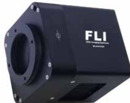
Light and Compact