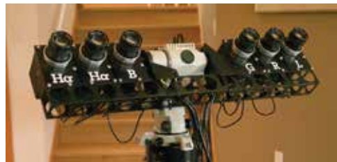
We specialize in unique solutions.