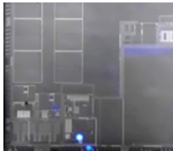
Photoemission microscopy on IC using water cooled SWIR InGaAs camera, with 20x objective, exposure time 30s