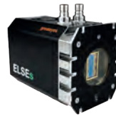
ELSEs 1k128 & 1k256

True 18-bit AD conversion allows to exploit the full dynamic range of the CCD sensor for highest performance and SNR. Choose from a wide range of sensors to find the best match with your requirements. ELSE is ideally suited for detection of very weak signal intensities where a low-noise floor is paramount. ELSE offers unprecedented possibilities for your measurements of tomorrow.