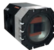
ELSEi 2k2k plus